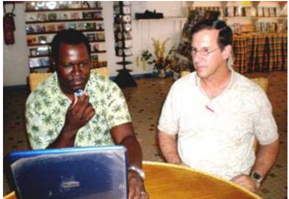
Recording the Prodigal Son story