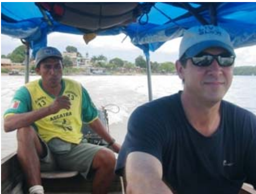
Crossing the Oiapoque River into Brazil